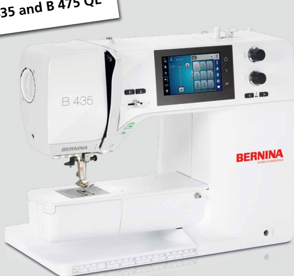
B 435 and B 475 QE

Talented. Energetic. Creative. Bold. A maker like Tiffany relies on the B 435 and B 475 QE to be powerful, easy to handle, fast and magical. Day in and day out. And her BERNINA never fails to deliver. She loves it and you will too.